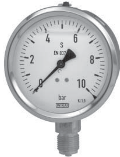
Bourdon Tube Pressure Gauge Model 213.53, radial connection